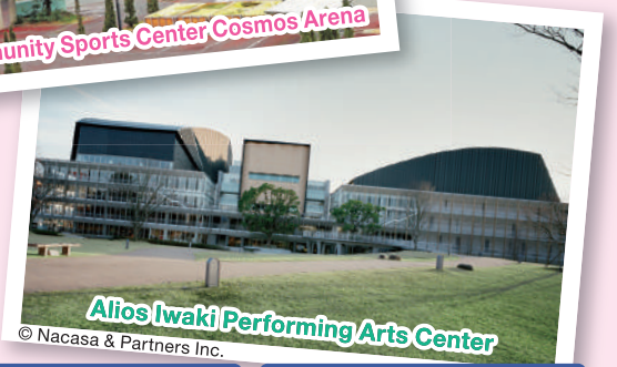
Alios Iwaki Performing Arts Center