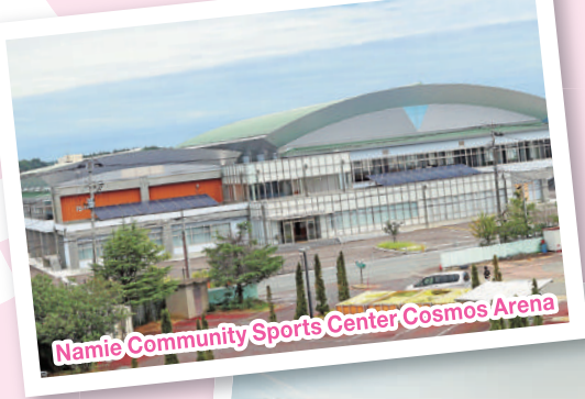
Namie Community Sports Center Cosmos Arena

The 5th International Forum on the Decommissioning of the Fukushima Daiichi Nuclear Power Station